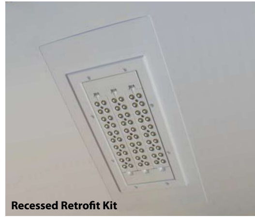
Recessed Retrofit Kit