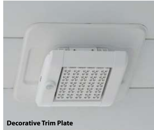
Decorative Trim Plate