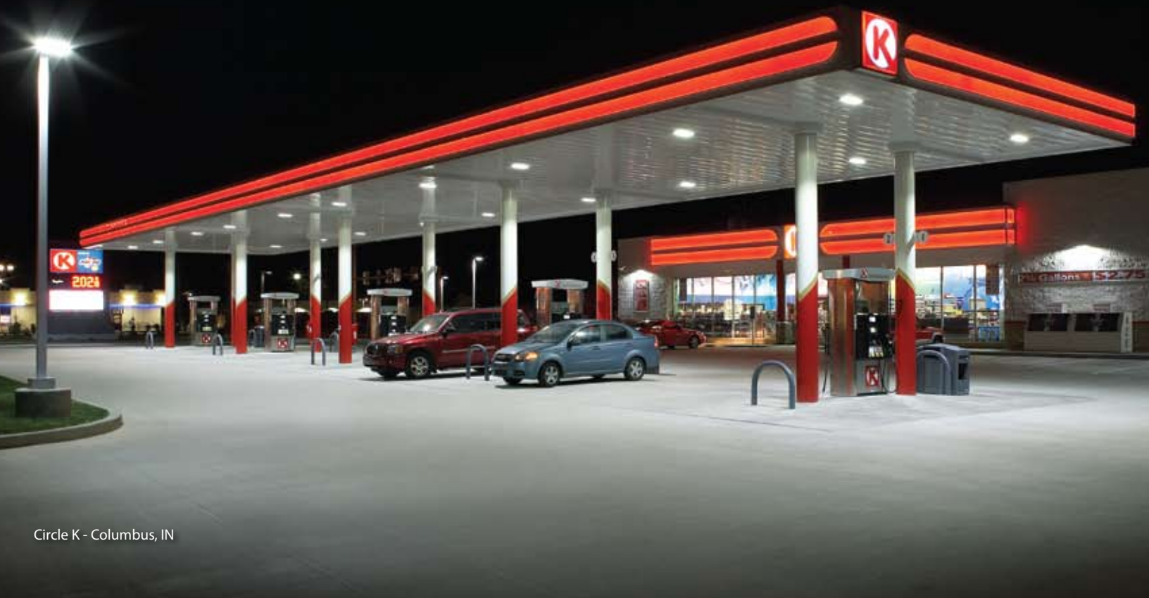
Circle K - Columbus, IN

Achieve results with advanced LED lighting from BetaLED.