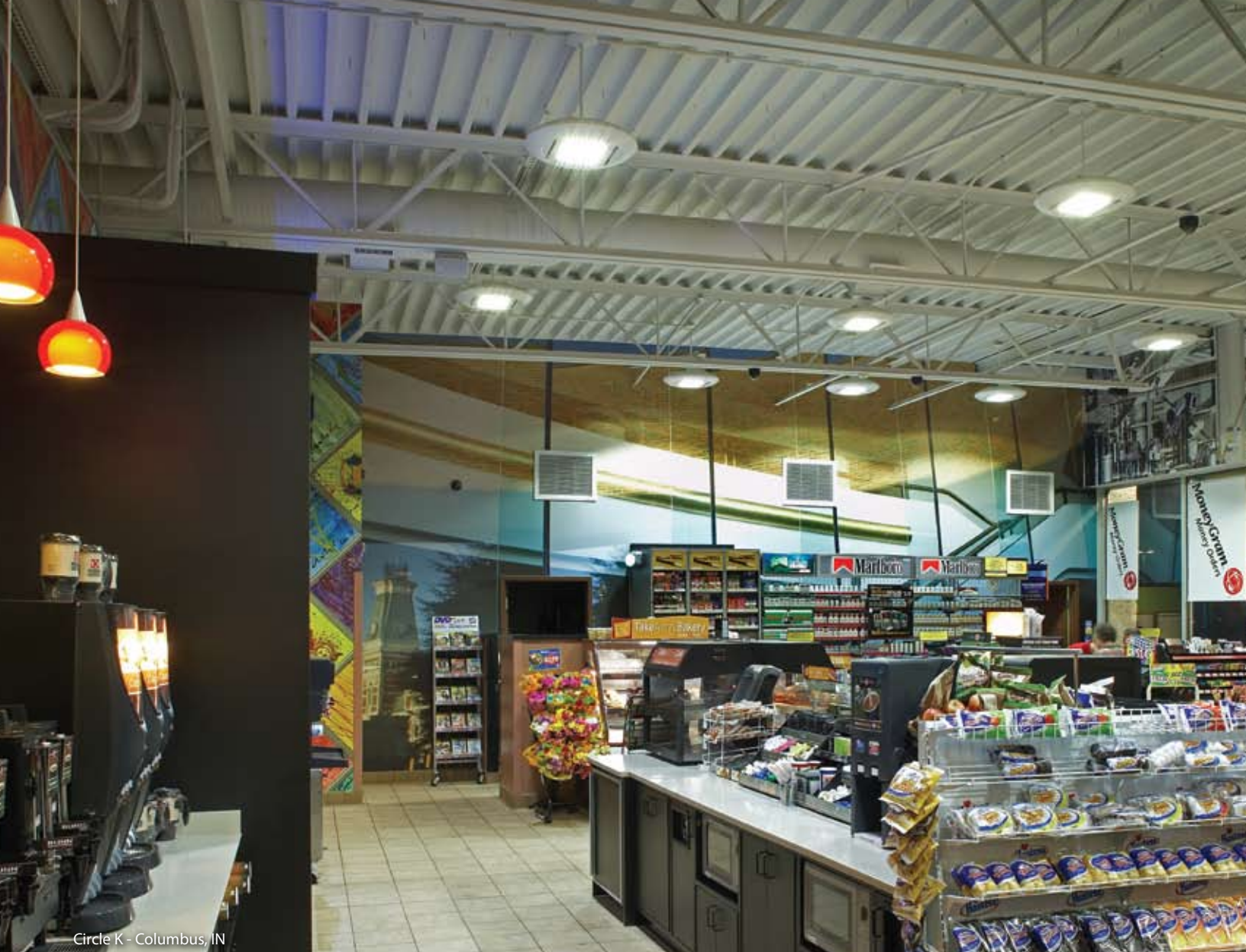
Circle K - Columbus, IN