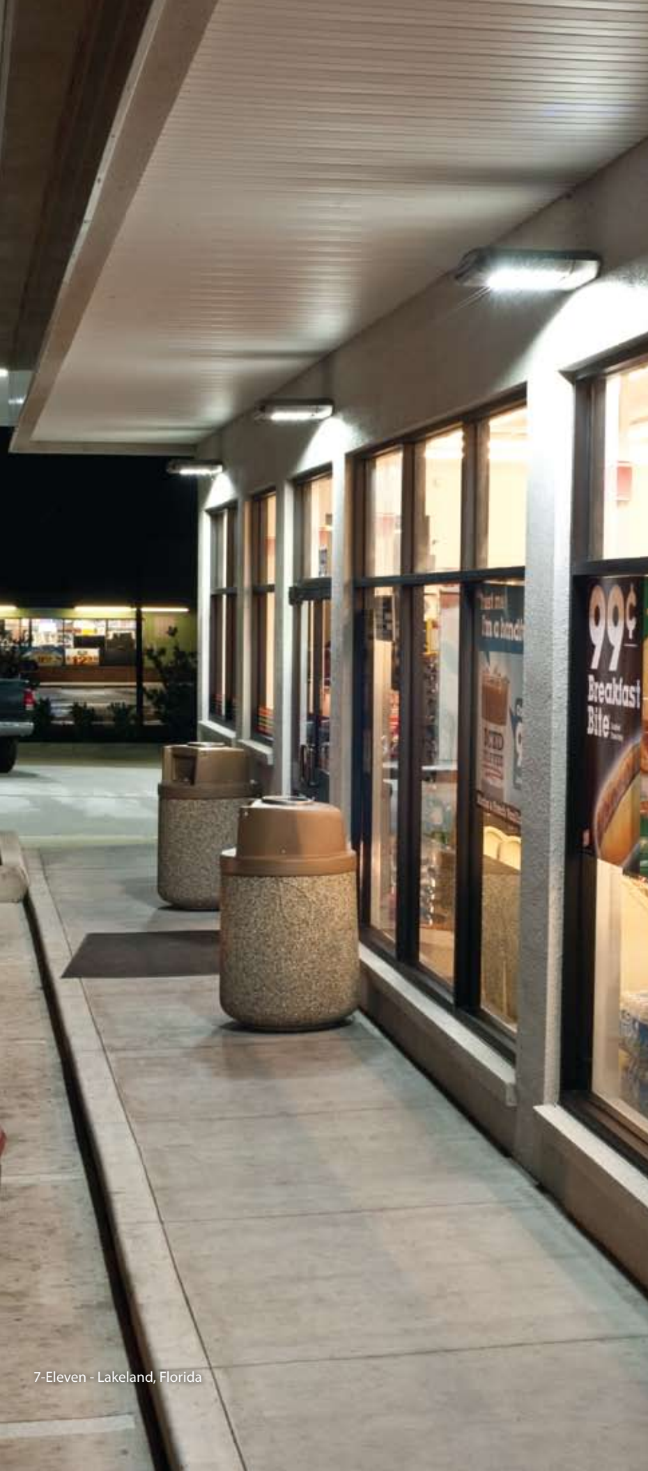
7-Eleven - Lakeland, Florida