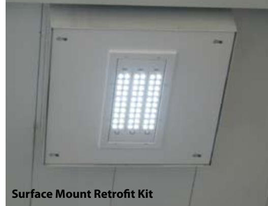
Surface Mount Retrofit Kit

A rectangular plate is pre-cut to accommodate BetaLED 30-, 60-, 90-, or 120-LED recessed luminaires for a flawless fit without exposed hardware.